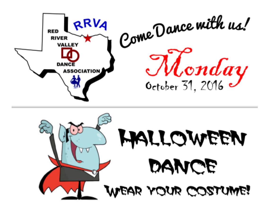
Square Dance Land 812 Travis Wichita Falls, Texas 76301